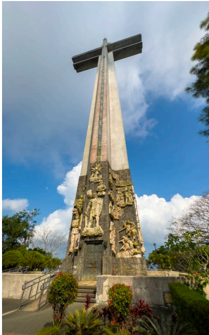
Mount Samat National Shrine Pilar, Bataan.