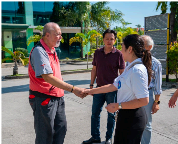
Building relationships with hospital leadership at Rosario Medical Center in Guagua, Pampanga