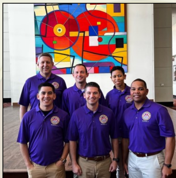
Army AGD Executive Board at the AGD House of Delegates in Chicago

Manage the finances for the Army Constituency of the Academy of General Dentistry. Maintain the bank account. Pay organizational bills, vouchers, scholarships, and mini-grants on behalf of the organization. Pay constituency taxes yearly. Represent at the Academy of General Dentistry Annual Scientific Session in July and Annual House of Delegates Session in November. Attend monthly meetings and attend presentations on behalf of the Army Constituency of the Academy of General Dentistry. (2 year term)