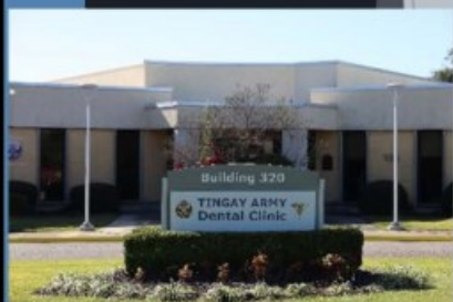
Tingay Dental Clinic Building 320, 228 E. Hospital Rd. Fort Eisenhower, GA 30905