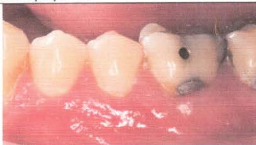
Appearance at postoperative week two.