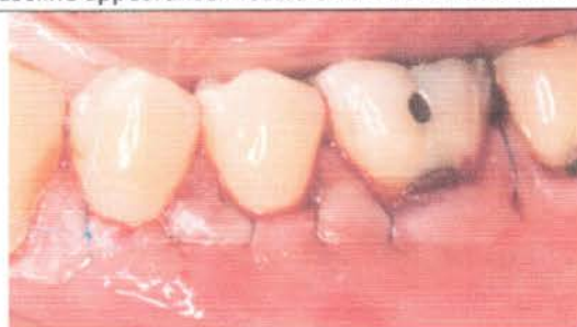
Subpapillary continuous sling suture.