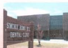
Smoke Bomb Hill Dental Clinic H-371a Gruber Rd. Fort Bragg, NC 28310