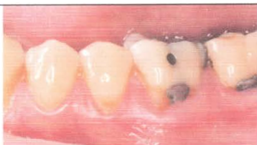
Baseline appearance. Recession at teeth #20 and 21.