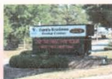
Fort Bragg Family Readiness Center 238 Interceptor Rd. Pope Field NC 28308