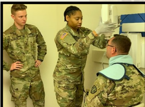
The 7212 MSU Soldiers take PA images on deploying Soldiers.