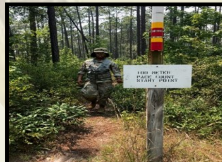
SPC Grant confirming her pace count in preparation for Land Navigation.