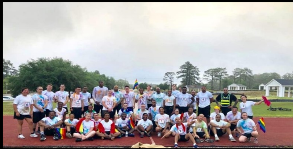
Fort Jackson DENTAC celebrated LGBT Pride month joined by Moncrief Army Health Clinic (MAHC) for a LGBT pride colorful PT session.